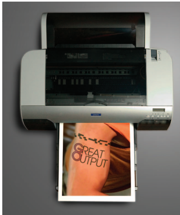
Will the image you print today still look as good 25 years from now?

WILHELM: Ray, as you know this isn't a perfect science. We are all learning as the field moves forward. And, you can find examples of this throughout the history of color photography: New technology can produce entirely new modes of image deterioration. For example, using "instant-dry" microporous papers with