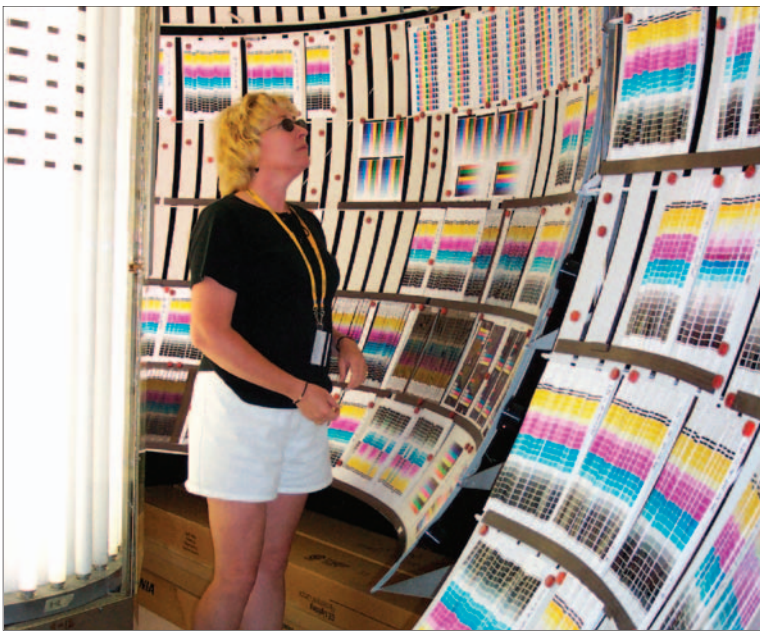
Different Companies Use Different Test Methods: In some of the same Rochester, NY facilities used to test the consistency of their traditional imaging papers and films, Kodak tests how their inkjet media will perform with different types of inkjet printer and ink combinations. Shown here are tests being conducted for Kodak's wide-format inkjet media.

The primary difference is that the ISO test standards are evolving from methods originally developed to test conventional photographs. The ASTM test standards are being developed by the same committee that wrote the test standards for oil paints, watercolors, pastels, colored pencils and other traditional fine-art materials.