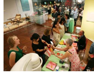
A book signing. People from fashion, publishing, and photography attended.