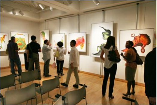
Exhibition prints were made by Michel using both the Canon PIXMA Pro9500 and imagePROGRAF iPF 8100.