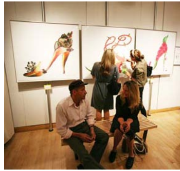
Original prints from the exhibition are available from www.shoefleur.com.