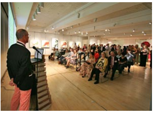
The gala event featured an illustrated lecture by Michel recounting the inspiration and evolution of Shoe Fleur .