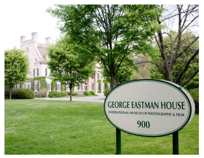
The International Museum of Photography & Film at George Eastman House in Rochester, New York has the most extensive collection of historical and modern color photographic processes found anywhere in the world.