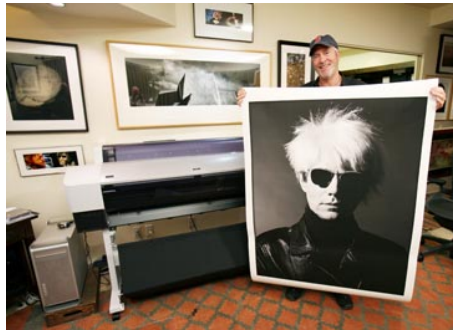
Shot for an advertising campaign for eyeglass maker L.A. Eyeworks, this 1986 photograph of the artist Andy Warhol is one of Greg Gorman’s most famous images.

Note: The Display Permanence Ratings given here are based on long-term testing with the previous generation of UltraChrome inks. WIR testing to date with UltraChrome K3 with Vivid Magenta inks indicates that significant increases in Display Permanence Ratings for black-and-white prints can be expected because the three-level, highly-stable carbon pigment based black inks in the UltraChrome K3 with Vivid Magenta inkset largely replace the cyan, magenta, and yellow color inks in B&W prints when they are made with the “Advanced Black and White Print Mode.” Very high stability inks such as these require extended test times; tests are continuing and this webpage will be updated regularly. “>200 Years” means “greater than 200 years,” and that tests are continuing.