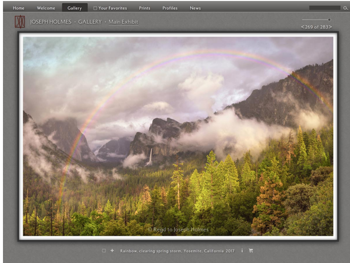
“Rainbow, clearing spring storm, Yosemite, California, 2017”