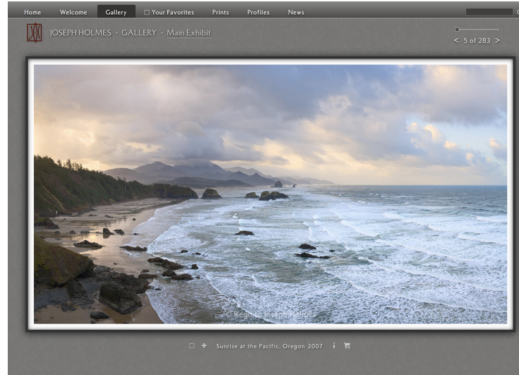
“Sunrise at the Pacific, Oregon, 2007”